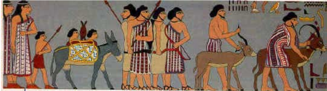
1 st Person - probably Judah A segment from the north wall in the tomb of Khnumhotep II at Beni-Hassan, Egypt (a copy)

6 + years (“Genesis” 45- -6) = [“2 year now the famine has been”] = [3+6] = 9 years = [5 more years for famine]. 1927- B.C. = Jacob Israel at the age of 130 = (“Genesis” 47- -9) = came into Egypt at Year 6 of Snusret II: As fulfillment of a prophecy = (“Genesis” 15- -13) = to settle Israel in Egypt. It was Senusret II = “Pharaoh Khakheperre” of Dynasty XII who ordered to settle Israel in “Goshen” at “Fayoum” . An Eternal historical documentation appears in the drawn message (probably documented by Joseph ) on the north wall of the tomb of Count Khanumhotep II (3) at Beni-Hassan, Egypt, as a “Point in Time” -- “In the year 6 of Pharaoh Khakheperre” .