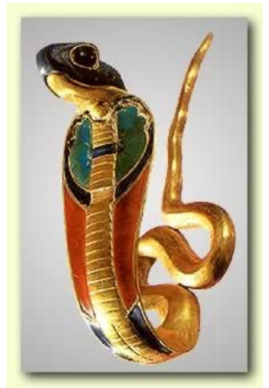
Joseph's Serpent? / discovered at the ruins of Senusret II's pyramid.

And the serpent said unto the woman: 'Ye shall not surely die; for God doth know that in the day ye eat thereof, then your eyes shall be opened, and ye shall be as God, knowing good and evil.' ("Genesis" 3- -4-5)